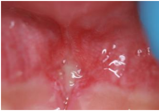
White diamond appearance 4-5 days post surgery