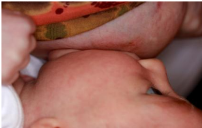
Poor latch due to upper lip not getting good attachment