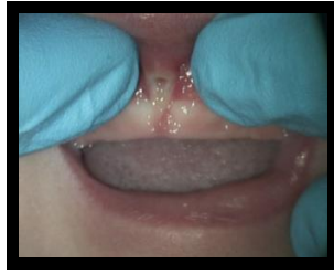
* *elevating and pulling the upper lip apart 2x daily