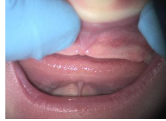
Abnormal lingual and maxillary frenum in the same infant