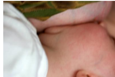
Latch improvement after frenectomies